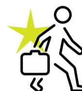
Leaving the company